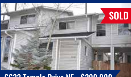
6632 Temple Drive NE - $290,000